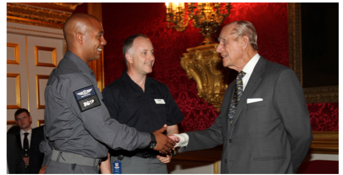
Air League Award